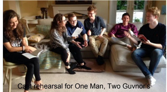
Cast rehearsal for One Man, Two Guvnor's