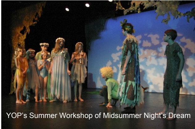
YOP's Summer Workshop of Midsummer Night's Dream