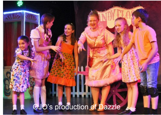
OJO's production of Dazzle

It's been an absolute joy to work with this wonderful group of young people and bring the show to life. We've challenged them, trained them, supported them and, yes, occasionally had to get a bit cross with them, but they have responded magnificently. I truly believe that doing a show like this is so much more than getting to the point of putting on the performances. It's about learning teamwork, concentration, focus and preparation. With a set of show dates in the diary there is no place to hide, no 'putting it off' – you have to do the work or you're the one who looks out of place on stage. These are all skills that transfer readily to other aspects of life and I know that many of the youngsters have discovered new things about themselves that will build and grow their confidence, as well as just having a lot of fun.