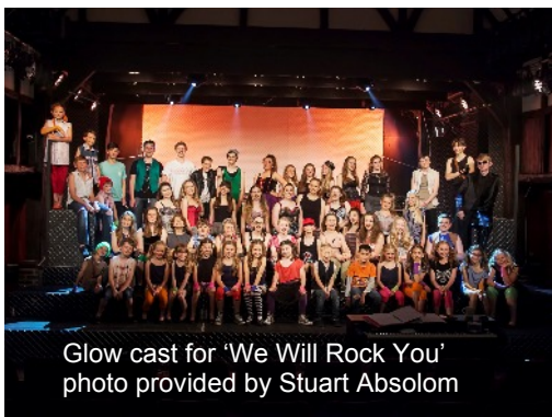
Glow cast for 'We Will Rock You'