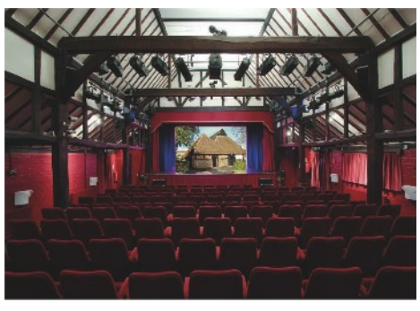
Volume 28 Issue 2 May 2023