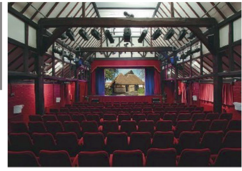
Volume 27 Issue 4 November 2022